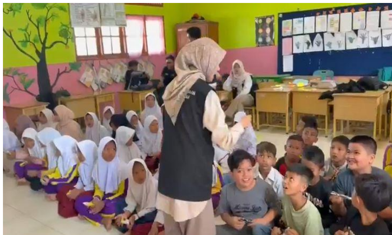
Figure 1. Providing material to students

Even though this activity went well, several obstacles were encountered during implementation. Time limitations mean the evacuation simulation material cannot be carried out in a more in-depth, structured manner. Apart from that, the unavailability of supporting facilities, such as evacuation routes and disaster education materials, in schools is a challenge in itself for the sustainability of disaster mitigation programs. Therefore, further collaboration among schools, local governments, and related institutions is needed to integrate disaster education sustainably into the school environment.