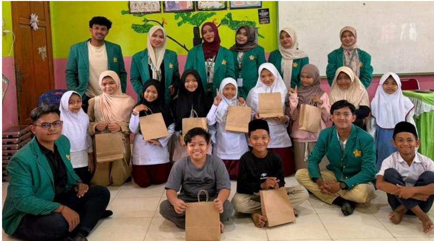
Figure 2. Closing, by giving prizes to students who contributed to the activity

In Figure 2 above, the research team expresses appreciation to students who actively participate to strengthen motivation in the learning process. This method aims to encourage more active student involvement during the activity and create a pleasant learning atmosphere. Students' enthusiasm during the closing session shows that an interactive and appreciative learning approach can increase students' interest in disaster mitigation material. Apart from that, the closing activity also provided students with a moment to reflect on the importance of disaster preparedness and concern for the environment as part of everyday life. In this way, educational activities not only provide additional knowledge but also create memorable, meaningful learning experiences for students.